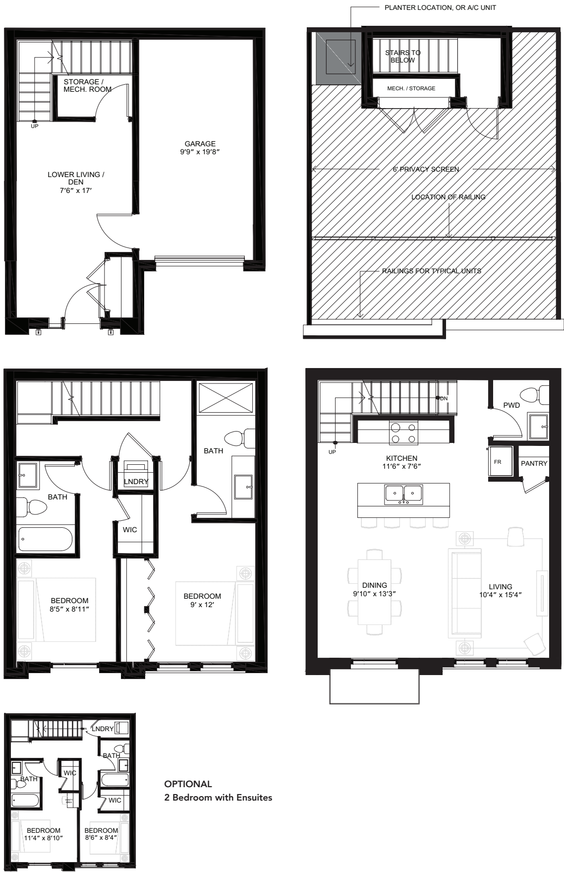
OPTIONAL 2 Bedroom with Ensuites